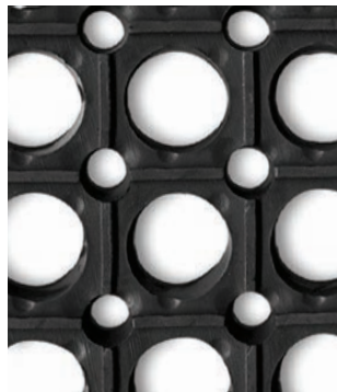
01. Black (for areas with water)

Keeping traction and comfort in wet working conditions is essential to a safe and productive work area. van Gelder Inc.' Kitchen Mats provide solutions for both wet areas and food-service areas - whatever the need, we've got you covered.