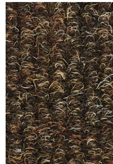
06. Harvest 1244