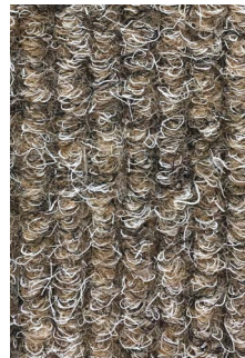
04. Beige 1153