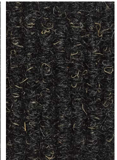
03. Black Shadow 2343