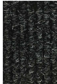
02. Charcoal 1198