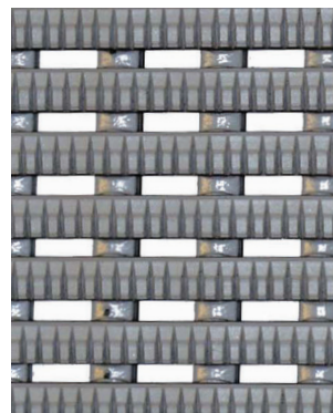
03. Silver LP