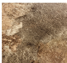
01. Mink Slate VNHT403

SOLUTIONS FOR EVERY ENVIRONMENT 1+ 866 284 6287 | www.vangelder-inc.com