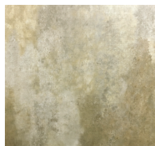
05. River Rock NVC2891