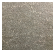
08. Ostrich Grey NVC3879