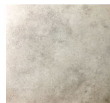
03. Oyster NVC1738