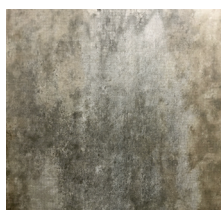
07. Metallic Delight NVC2893