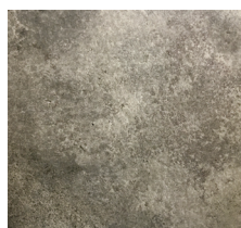
02. Oxidized Pewter NVC1737