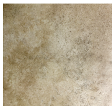
04. Toasted Almond NVC1739