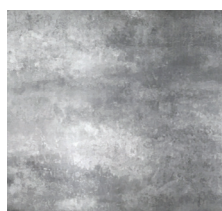
11. Titanium NVC3724*

*Indicates available in 18" x 36" tiles as well.