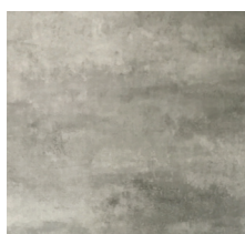
10. Silver Knight NVC3744*